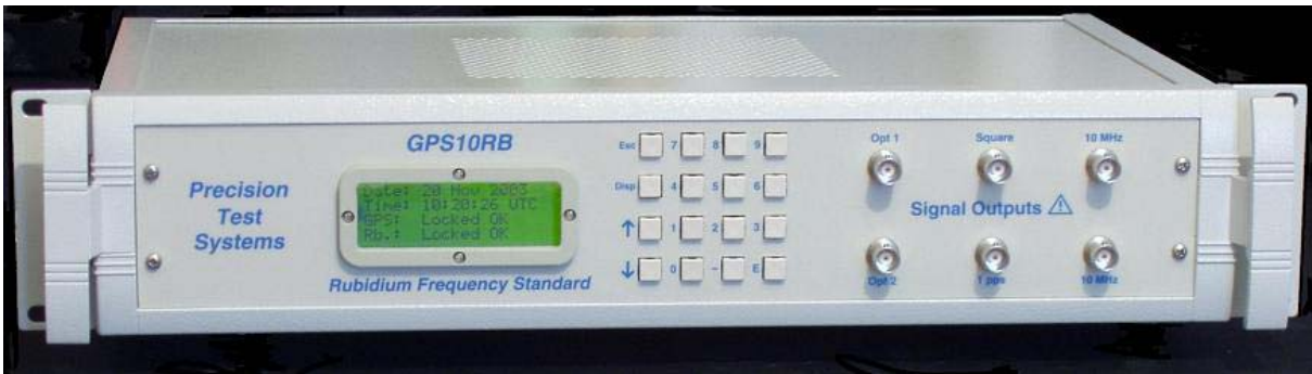
Shown above is the GPS10RB 19" rack mount version. The GPS10R is a bench mount version.